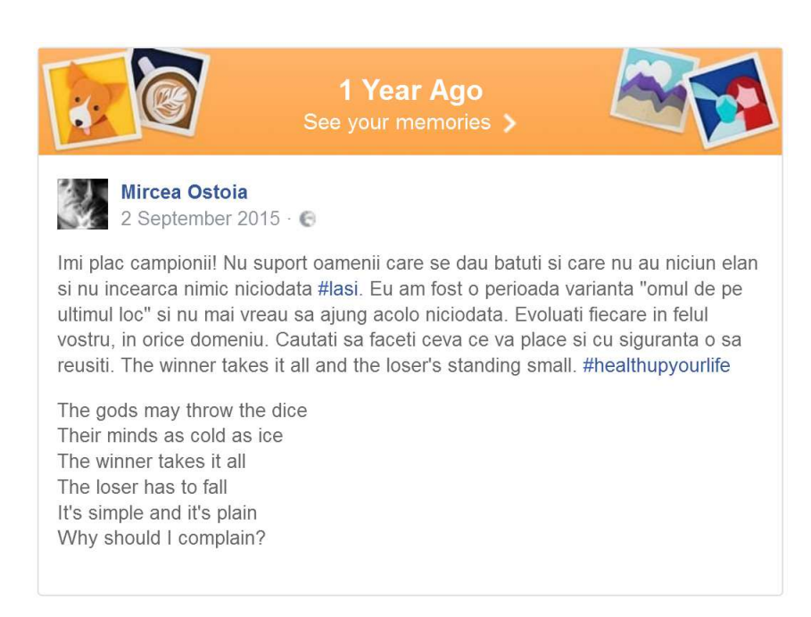
Fig. 2. Sample of #healthupyourlife (this is available on the link in footnote 2)

Using on the other hand this hashtag as a research tool in the sense of Roger's folksonomies retrieves a lot greater deal of posts all related to various aspects ranging from travel pictures to technology, from movies featuring characters that correspond to the struggle of succeeding to doctor's appointments and physiotherapy sessions, from food to sports equipment, from UNESCO world heritage sites pictures to the discovery of ancient relics. Such diversity of opinion is achieved in many ways. The first and the most commonly used is the self-produced text in which he comments an event, either personal or a repost, sometimes anchored in the political or social aspects of life from the generaly interest public sphere or, as this is often the case, in smaller private life events of friends on Facebook. Besides these texts, he also hashtags widely circulating memes or photos he takes showing various general or familiar snapshots.